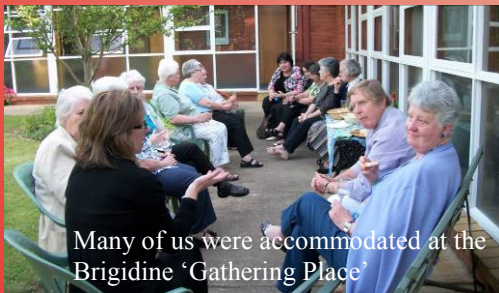
Many of us were accommodated at the Brigidine 'Gathering Place'