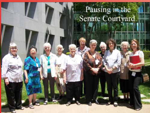
Pausing in the Senate Courtyard