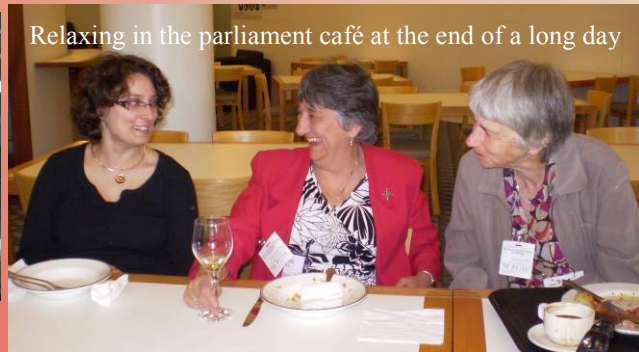
Relaxing in the parliament café at the end of a long day