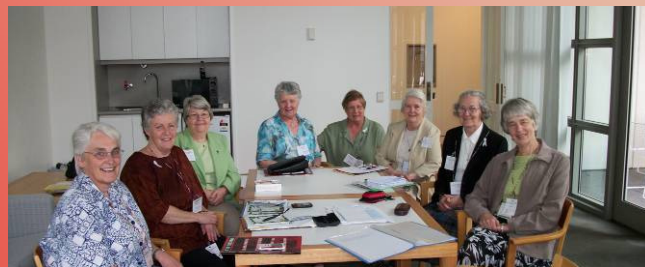
Our comfortable workspace within Parliament

ACRATH is endorsed by: Catholic Religious Australia - the peak body for 180 religious orders in Australia, representing more than 8000 religious sisters, brothers and priests. www.acrath.org.au