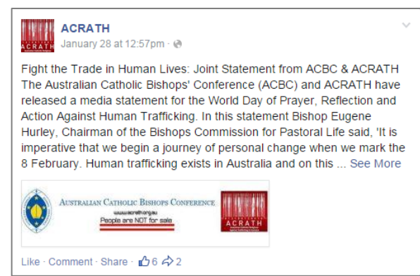
ACRATH Facebook post