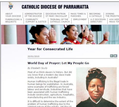
ACRATH mentioned in above article