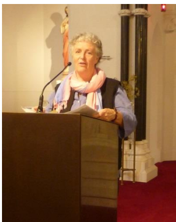
ACRATH, EO, giving homily at the Abbotsford Convent on Bakhita Day.