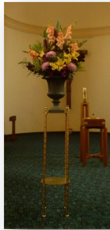
Reflection & Prayer